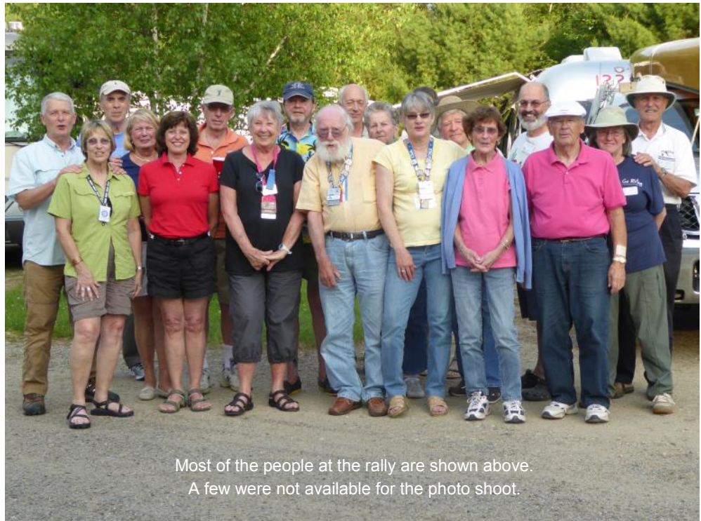
Most of the people at the rally are shown above. A few were not available for the photo shoot.