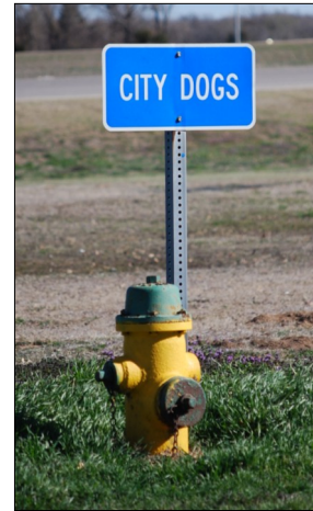
Someone in the Oklahoma DOT has a sense of humor - We found these signs on I 40 in the Sooner state.

While some of us can't imagine traveling without dogs, others can't imagine traveling with them. If you keep your dog under control and clean up after them, you won't give others much to grumble about.