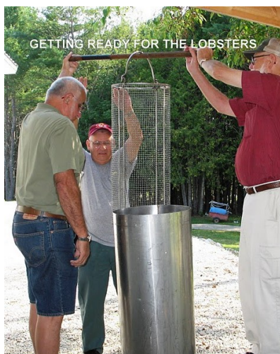
GETTING READY FOR THE LOBSTERS