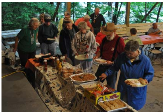
Chow Line at the Welcome Dinner