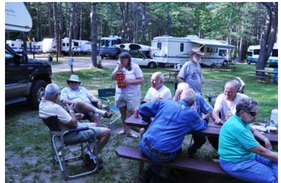
Relaxing on the First Day